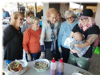
A whole lot of new Grandmas